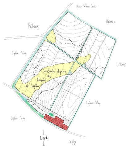
The soil map of Les Pensées

Today Les Pensées is a member in the small circle of the great wines of Pomerol's plateau. To mark this important transformation, we redesigned the label of Les Pensées, while keeping the iconic graphic style of Château Lafleur.