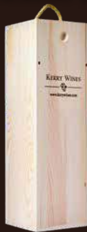
KW Single Wooden Box*