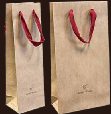
KW Kraft Paper Bag