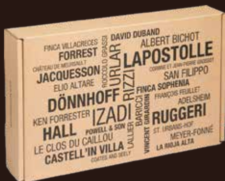
6-Bottle Flat Box